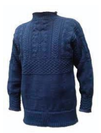
A typical gansey sweater