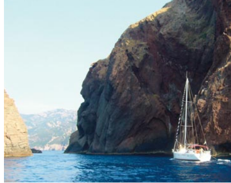
Long motoring days in the Mediterranean should be addressed by short periods of flat-out motoring