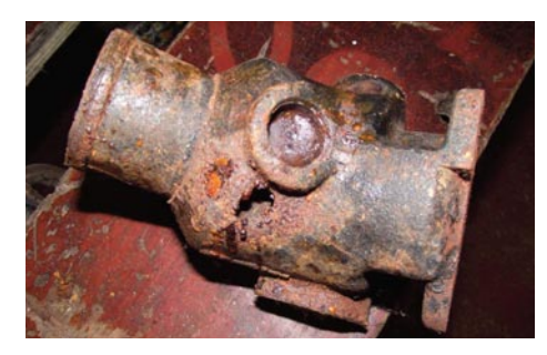
Volvo manifold Perforation of the cast iron manifold due to corrosive salts.

I know of a number of yacht owners who requested yards to have a look at their engines that were not performing as well as previously. They were told to leave the boat for attention. The standard solution is to motor flat out to a convenient marker a mile or two away, and back. Problem solved, bill for £100 presented. Owner delighted with rejuvenated engine.