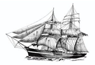
The Williams Expedition Rediscovering Antarctica

The expedition aims to showcase North East talent, engineering and technology on a world stage and in conjunction with Newcastle University undertake meaningful marine science as well as involving those not normally engaged in ship