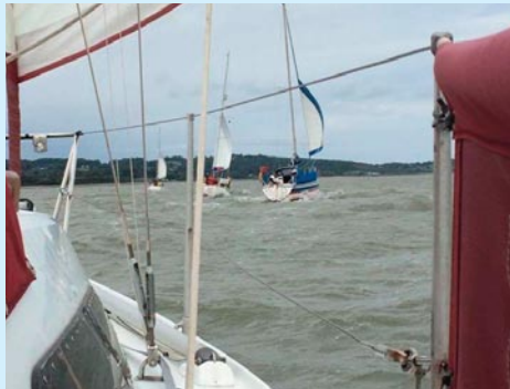
A super weekend was had, thanks for the Company.