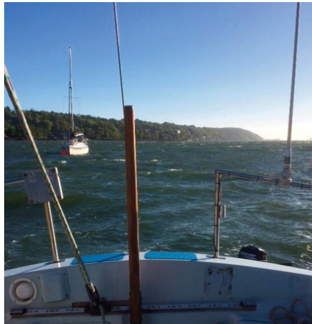
May: North East wind in The Straits