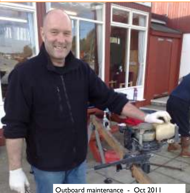
Outboard maintenance - Oct 2011 Soon time to find out if it will fire up again!